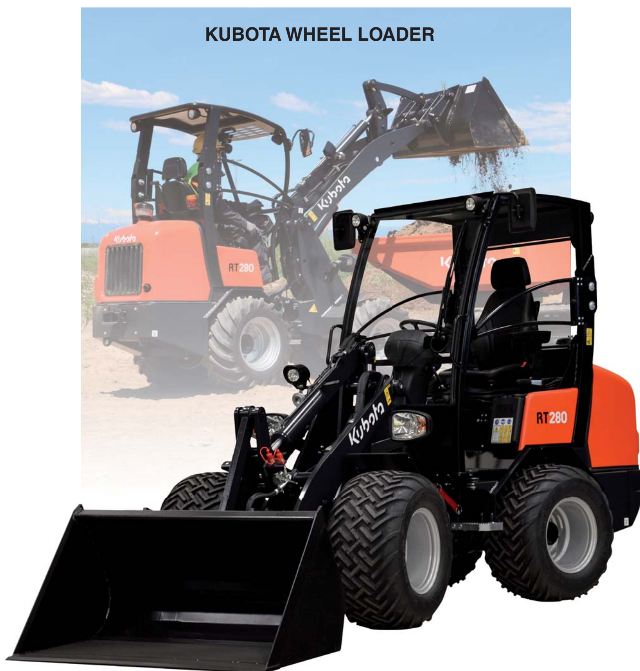
KUBOTA WHEEL LOADER