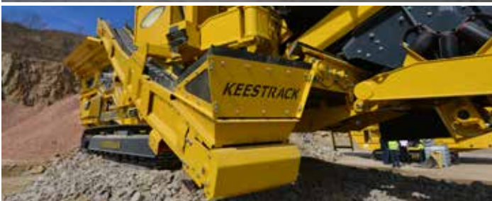
Swiveling return/stockpile conveyor