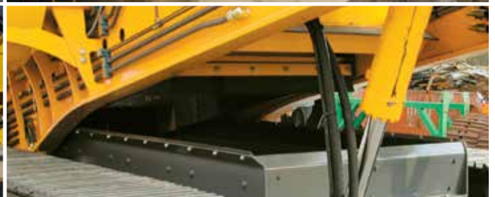
Patented hydraulic lifted chassis