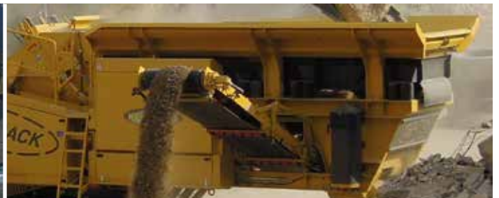
Separate driven pre screen