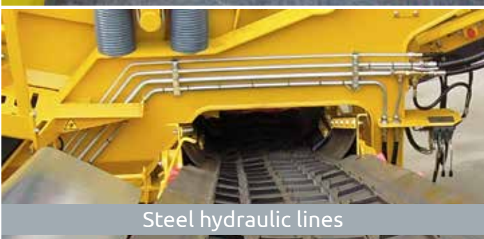
Steel hydraulic lines