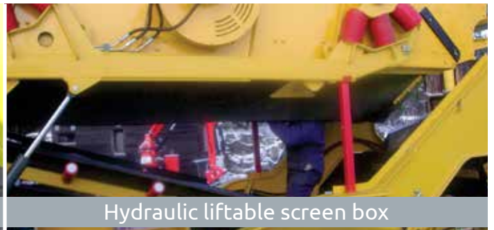
Hydraulic lifttable screen box