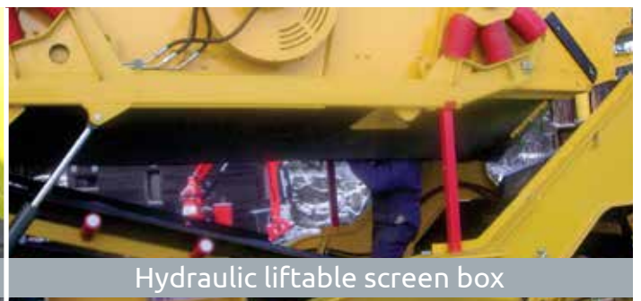
Hydraulic lifttable screen box