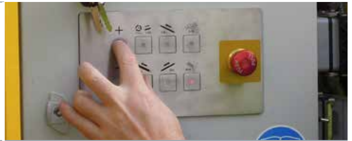
Relytec control system