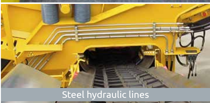
Steel hydraulic lines