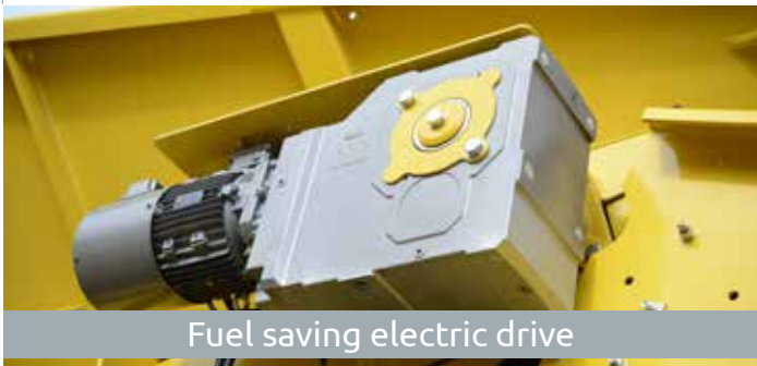
Fuel saving electric drive