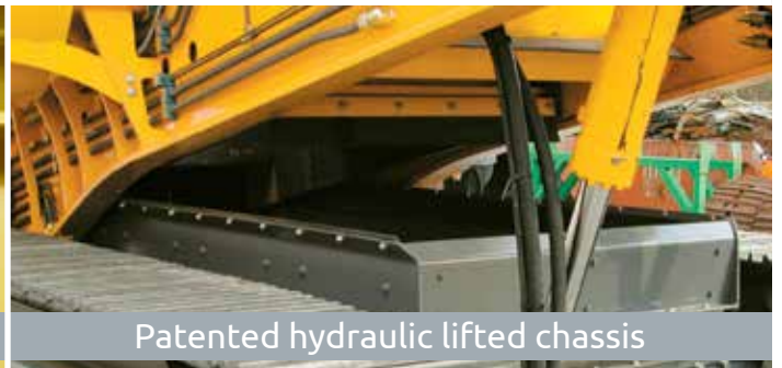
Patented hydraulic lifted chassis

The goal of Keestrack is to make products as user friendly as possible by using today's technology.