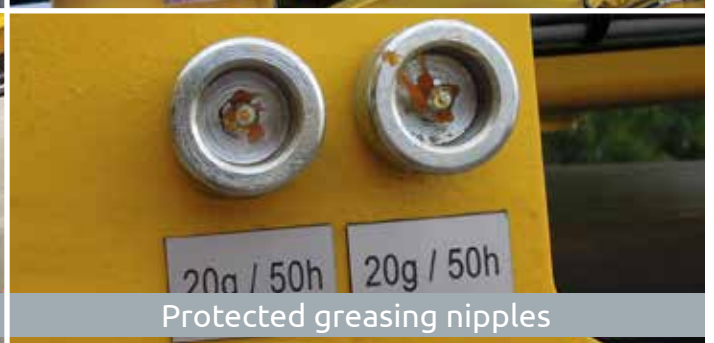
Protected greasing nipples