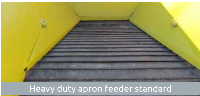
Heavy duty apron feeder standard