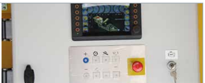
Relytec controls with PLC