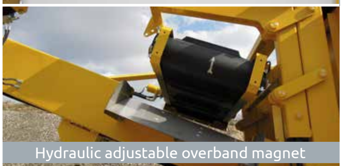
Hydraulic adjustable overband magnet