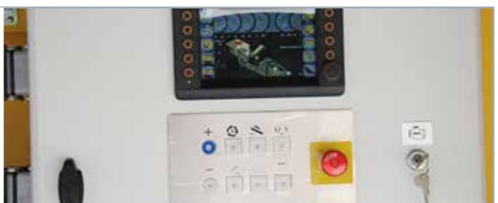
Relytec controls with PLC