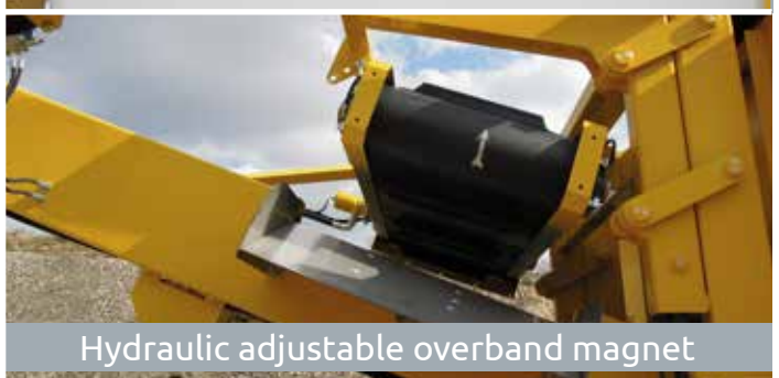
Hydraulic adjustable overband magnet