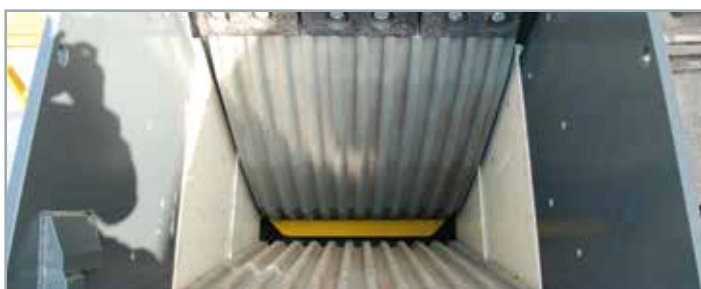
Hydraulic gap adjustment to prevent clogging