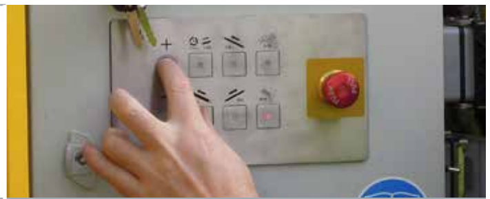
Relytec control system