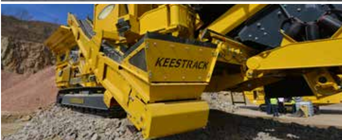
Swiveling return/stockpile conveyor