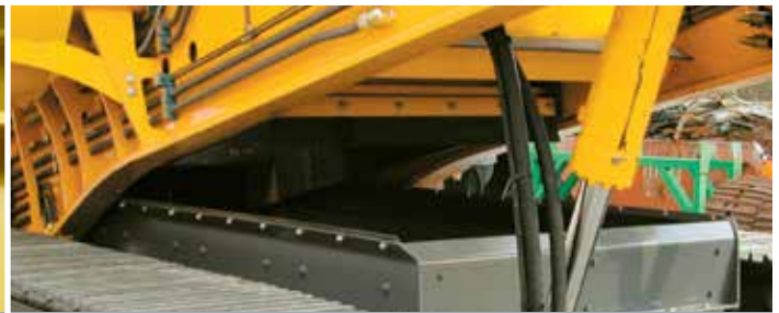
Patented hydraulic lifted chassis

The goal of Keestrack is to make products as user friendly as possible by using today's technology.