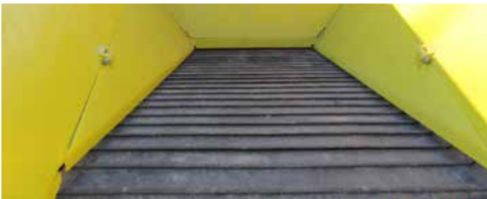
Heavy duty apron feeder standard