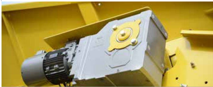
Fuel saving electric drive