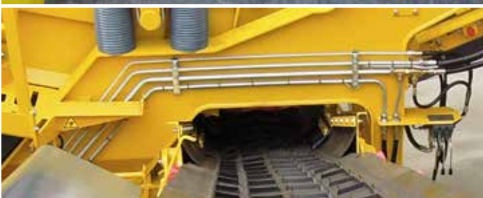
Steel hydraulic lines