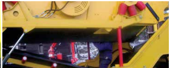
Hydraulic lifttable screen box