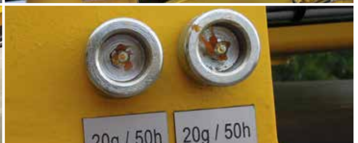
Protected greasing nipples