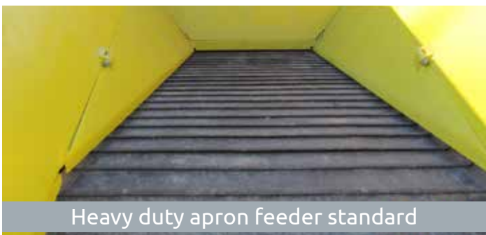
Heavy duty apron feeder standard