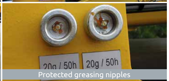
Protected greasing nipples