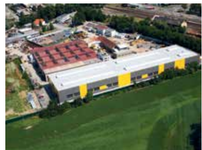
TŘÍDIČ, s. r. o.