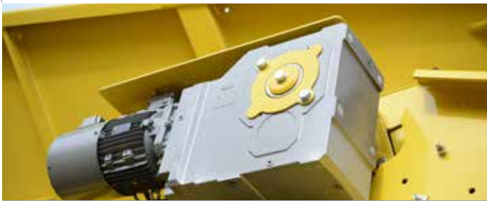
Fuel saving electric drive