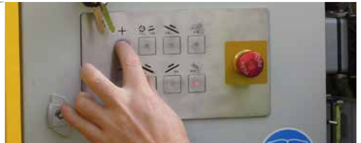
Relytec control system