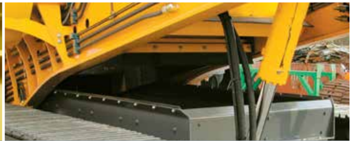
Patented hydraulic lifted chassis

The goal of Keestrack is to make products as user friendly as possible by using today's technology.